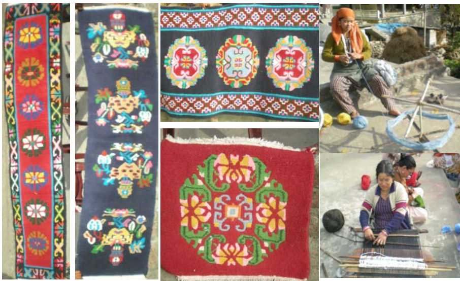
Woolen Carpets and Mats from Uttrakhand